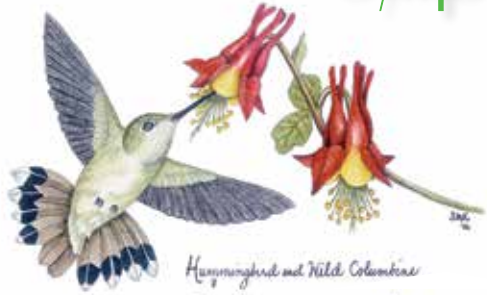
Hummingbird and Wild Columbine